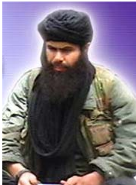
Abdelmalik Dourkdal (a.k.a. Abu Musab Abdel Wadoud)