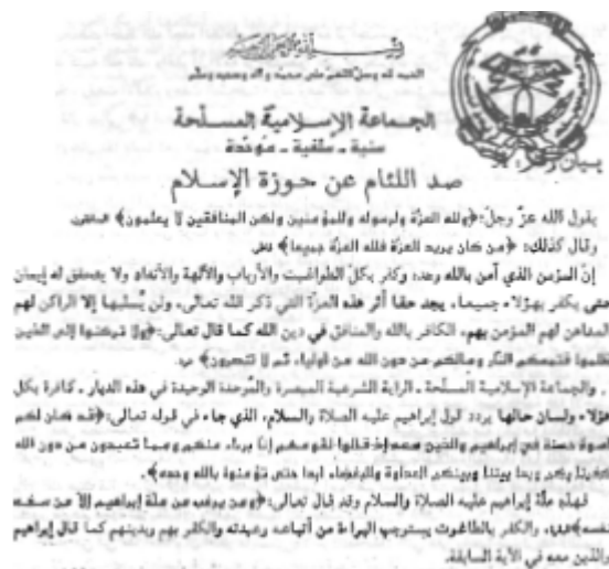
GIA Communiqué #52 - August 9, 1997

During the summer of 1997, Zouabri finally crossed the line when he began to distribute a shocking new fatwah “so chilling” that the GIA’s own official spokesmen abroad “were unsure if this had been the same group that they had known before.” 69 Though the document was dated August 9, 1997, pre-