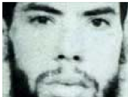
Djamel Zitouni (a.k.a. Abu Abdelrahman Amin)

On September 26, 1994, Gousmi was finally killed in a clash with security forces, and replaced by Djamel Zitouni (a.k.a. Abu Abdelrahman Amin). Zitouni's two-year reign of power would see some of the most impressive achievements by the GIA—such as the unprecedented Air France hijacking. However, Zitouni's rise to power also marked the beginning of the end for the GIA, which had become ideologically strained and a target for Islamist political competitors. According to Abu Hamza al-Masri—before Zitouni had a chance to assume control—the Algerian FIS party “attempted to infiltrate the group in order to later take control of it... But other senior members of the GIA led a counter offensive against these tactics... [former] FIS members were excluded, along with their leadership being shunned... One of the senior members of the FIS who joined the GIA... confessed to a conspiracy of trying to take over the GIA and further added that he joined the GIA only to take control of the Islamic militants.