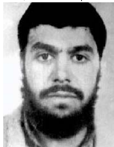
Hassan Hattab (a.k.a. Abu Hamza)

"Since [2003], Abu Hamza has kept himself secluded from the mujahideen. Recently, we learned about some of his suspicious behavior after he contacted one of our brothers in an attempt to