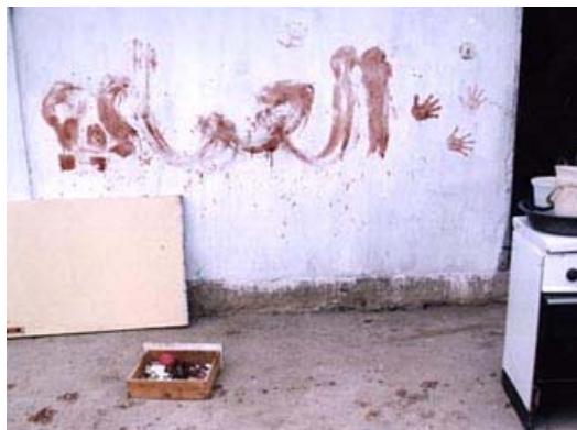
During an attack on an Algerian village, GIA extremists use the blood of victims to inscribe the word "Jihad" on the wall of one residence.

"The GIA has fought all Unbelievers of all ethnicities and groups, and ordered every Unbeliever to leave these lands (Algeria), and gave them a period of one month... similar to what the Messenger of Allah, peace and blessings be upon him, did... And so GIA has cut them off from the security of living in Algeria, and allowed the spilling of their blood if they chose to stay in our land. Some have heeded the warning, and others refused, so GIA started to kill them, singles and in groups, and after that another group fled, after that only those whose presence is essential to fight Muslims and Islam have stayed behind. Among those are politicians, military personnel, and missionaries." 37