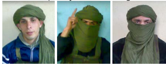
The April 11 suicide bombers

Meanwhile, back in Algeria, the GSPC has carefully studied these strategic lessons and how "the jihads in Iraq and Saudi Arabia" have forced the U.S. to seek alternative energy sources beyond the borders of the traditional Middle East. Thus, according to the GSPC, the U.S. has "decided to utilize the African continent and its vast deserts—especially those extending from Sinai to Nouakchott where there are substantial oil and natural gas resources and also large areas that could be used as American military bases." 139 In response, the GSPC has directed its forces to sabotage the export of Algerian oil and gas supplies by Western companies without causing permanent damage to potentially valuable material resources. As