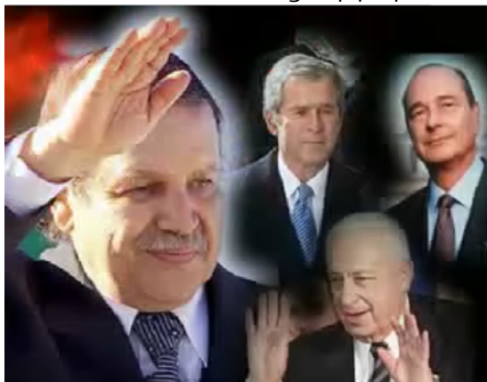
"The Enemies of Islam": An image from the GSPC propaganda film "Jahim al-Murtadeen" ("Apostate Hell"), 2005.