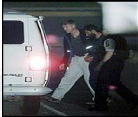
Kansi arriving at the Fairfax County Jail on June 17, 1997, after his capture in Pakistan.