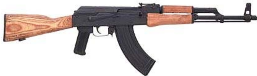
AK-47 similar to the one used by Kansi in the shooting outside CIA headquarters