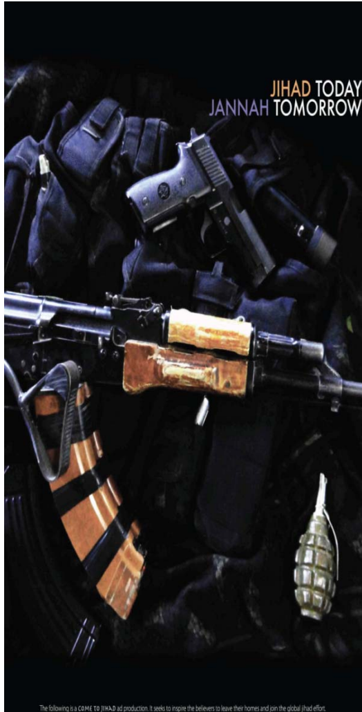
Illustration from Issue 4 of Inspire Magazine, telling readers to fight today, go to paradise tomorrow