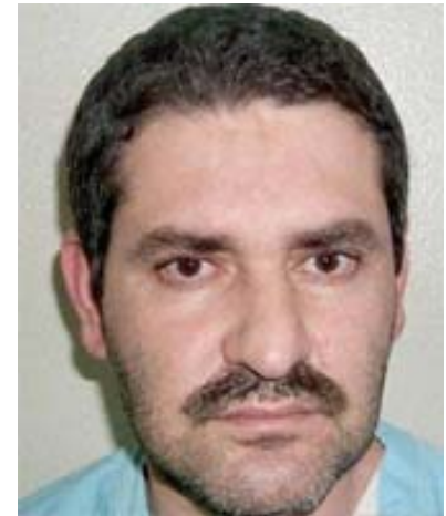
Mir Aimal Kansi