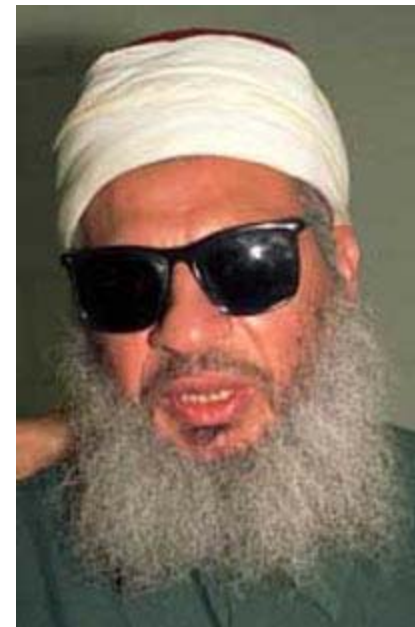
"The Blind Sheikh" Omar Abdel Rahman