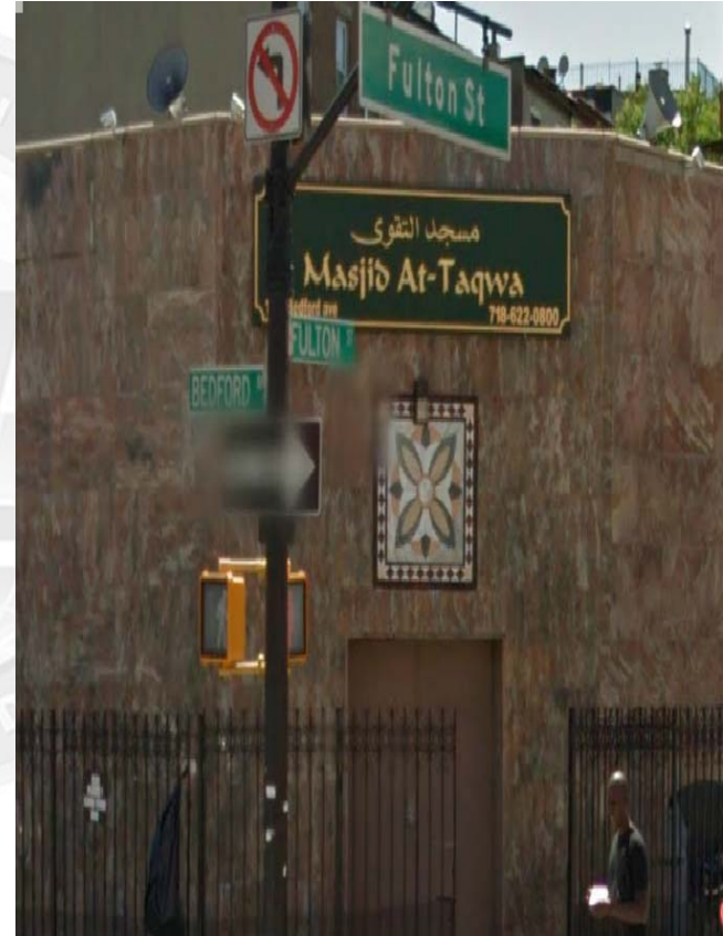
Masjid al Taqwa