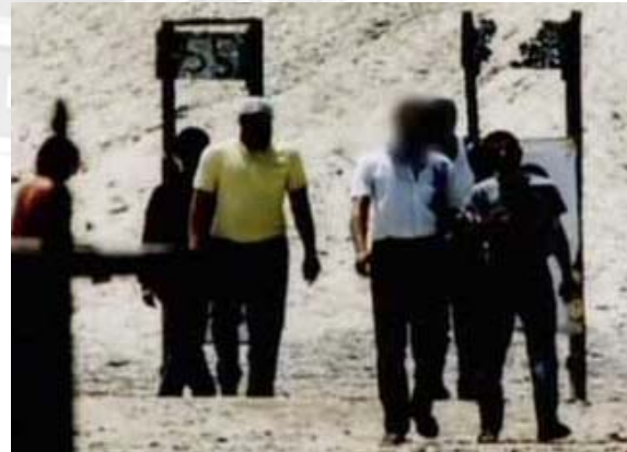
1989 surveillance photo of 1993 World Trade Center bombing conspirators, including Hampton El, training at the Calverton Shooting Range in Long Island, NY. These individuals, all devotees of “the Blind Sheikh” Omar-Abdel Rahman, worshipped at the same Brooklyn mosques as Robertson and the “Forty Thieves.”