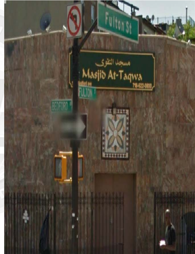
Masjid al Taqwa