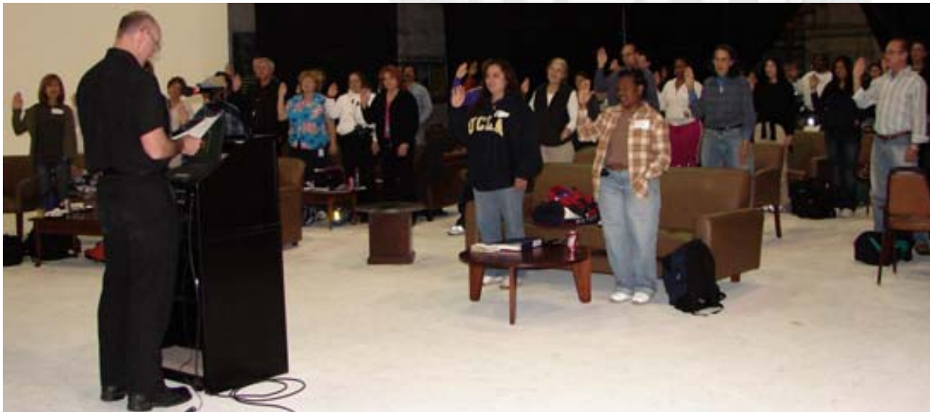
Members of the March 2006 Culvert City “Mega Cert class” swearing in.