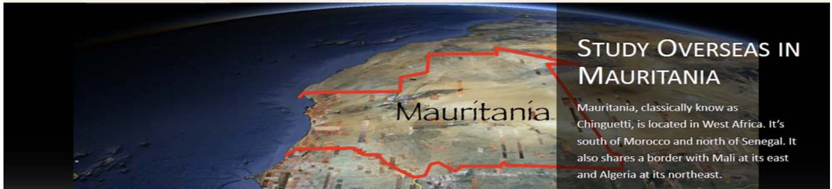
Top, image from FIKS site. Bottom, image from The Darul Arqam site.