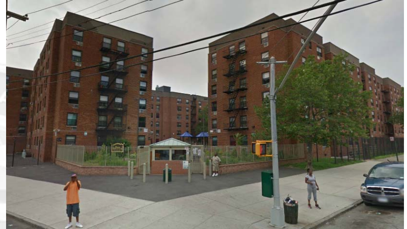
Noble Drew Ali apartment complex. [source: Google Maps, June 2011 image].